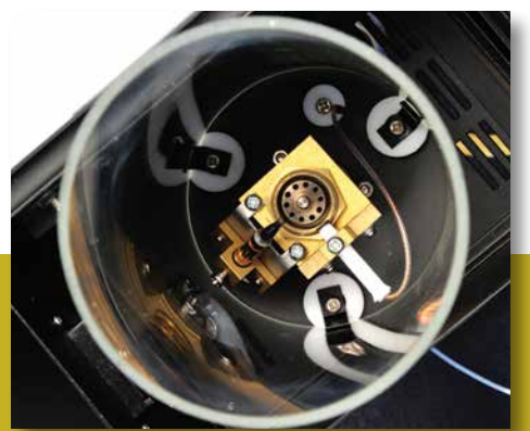
Burner Ignition System showing ignitor, 10 hole compact burner, flame shield and flame safety detector.