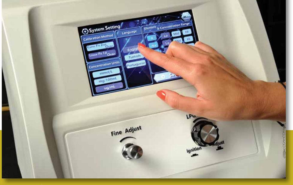
Selection of analytical parameters using touch screen